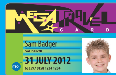
11-16 MEGATRAVEL PASS