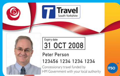
ENCTS DISABLED PASS